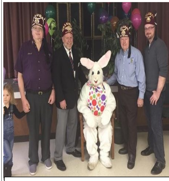
Some of our nobles with the Easter Bunny

The day began with a basket stuffing party and blowing balloons up to be distributed at the end of the party. The baskets this year contained a large solid chocolate rabbit, Reese's eggs, jelly beans, marsh mellow rabbit tails, airheads and a small