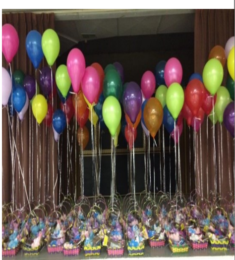
Baskets and balloons waiting for children