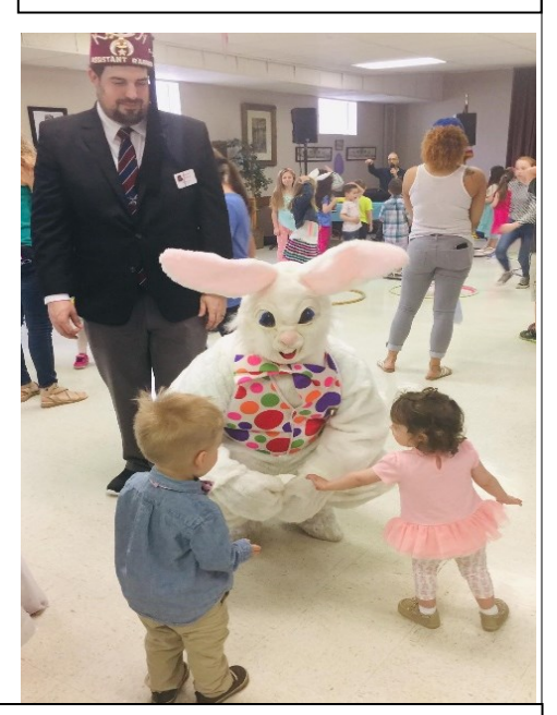
The Easter Bunny greeting some of the children